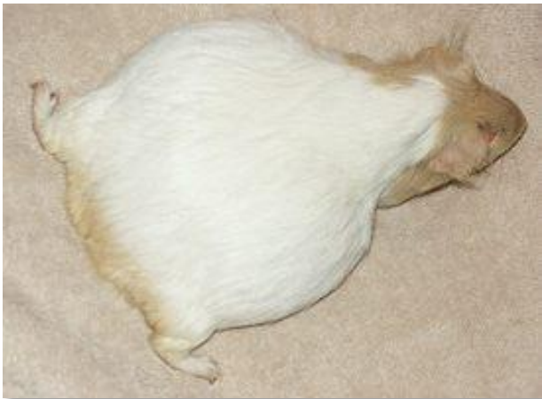
Above: A very pregnant guinea pig!

If by chance your guinea pig does fall pregnant, or you happen to adopt one that is already pregnant (which is a fairly common occurrence; especially from pet stores), you should take extra care to nurture your expectant mum.