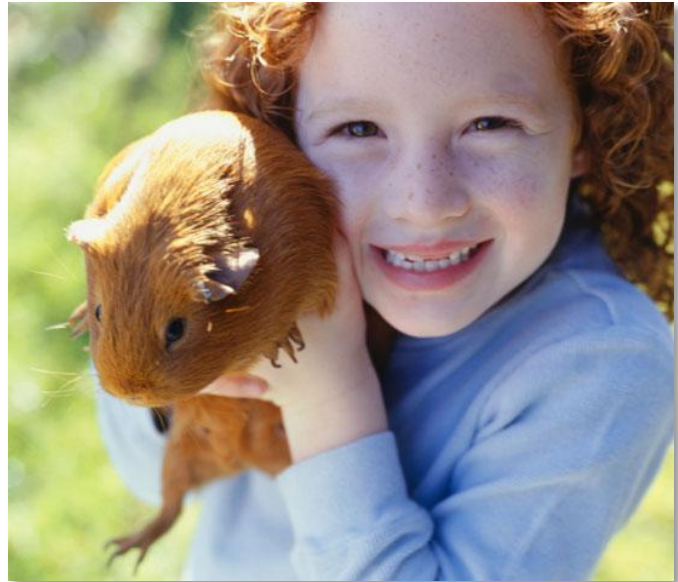
Above: This guinea would not be feeling very safe right now!

If your guinea pig wiggles and squirms that means it is scared and you are probably not holding it correctly.