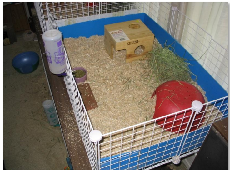
Above: wood shavings make ideal bedding for a guinea enclosure.

You will need to change the bedding about two or three times a week, depending on how many guinea pigs you have. As long as you change the bedding frequently, your guinea cage will not smell. After removing and discarding all the bedding and newspaper, wipe out the cage with some warm water and a mild detergent solution or spray made up of three parts water, one part vinegar. Whatever cleaning agent you use, be sure it is mild and free of harsh chemicals.