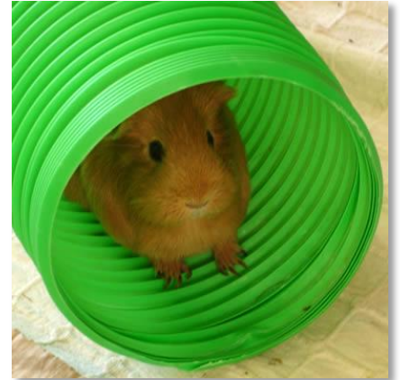
Above: Give your guinea lots of fun hiding places.