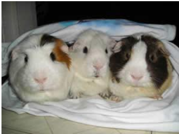
Above: A sensible mixing of guinea pigs can create a harmonious 'herd'.

While both male and female cavies make great pets, you MUST know what the gender is of each guinea pig before you buy it. This is of the greatest importance, as you do not want your guinea pigs to fight and least of all, you don't want any unwanted litters!