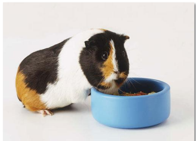
Above: Make sure your guinea has her daily feed in a bowl that she can't tip over!

The easiest way to achieve this is to feed your guinea pig plenty of vegetables and fruit daily. Most of the fresh produce we eat is ideal for your guinea pig, see the table on the next page: