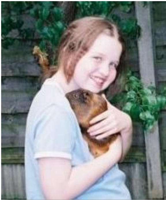
Left: This guinea would be feeling very safe right now!