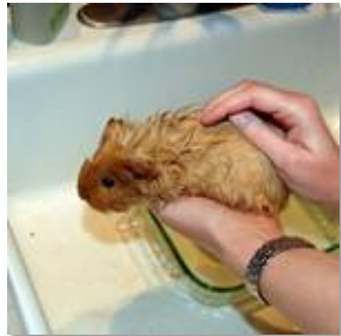
Above: Take care when bathing your guinea pig as they are extremely sensitive to the cold.

Rinse by pouring water along the animal's neck, so it stays out of her face and eyes. Make sure that all of the shampoo is thoroughly rinsed out and then gently pat the guinea pig dry with a towel.