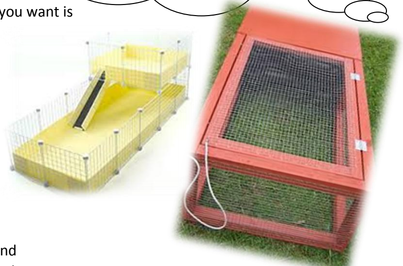
Above: This is just one style of indoor & outdoor guinea pig hutch that you can purchase from pet or produce stores. Also, check out EBay.

Guinea pigs need at least two square feet of cage space including space for their hiding places and food bowls. Each additional guinea pig needs an extra two to four square feet.