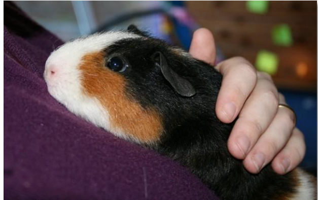
Above: Sick guinea pigs hide it well, so keep a close eye on your pet; especially if there is a sudden change in behaviour.

In the wild, predators are quick to kill sick and injured guinea pigs. As a result, guinea pigs have learned to hide the fact that they are sick. You will have to keep a close eye on your guinea pig's general wellbeing, otherwise by the time you realize that the animal is ill, it may be too late. The following chart may help you assess whether you need to take your guinea pig to the vet or it is something that can be treated at home: