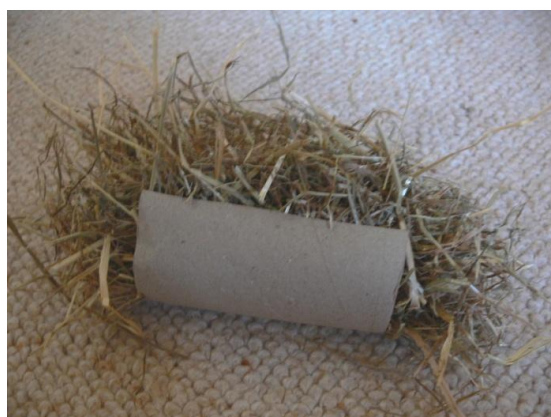
Above: Hay stuffed inside an empty toilet roll makes for a good 'food enrichment' toy for your Guinea

A favourite food for guinea pigs is fresh grass. Ensure that any grass is free from pesticides, dog fouling and toxic plants. It is best to restrict grazing time on new spring grass because too much can cause diarrhea. Do not feed grass cuttings as these can cause digestive problems. Dandelions are also a favourite, but only give a few of these as they can also cause diarrhea.