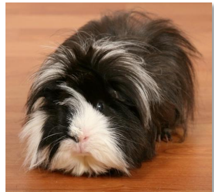
Above: Long haired breeds need brushing every day to avoid matting.

Short-haired guinea pigs will only need to be brushed every couple of weeks. This will get rid of any dead hair and keep your guinea looking sleek and clean.