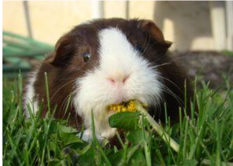
Above: Guinea pig teeth grow constantly, so they need to chew to keep them trim.

Guinea pig's front teeth grow constantly; unless the animal keeps the teeth pared down by chewing on hard things like carrots, turnips, chew sticks, branches or wooden blocks, they will grow so long that it hurts it to eat, and then it will stop eating altogether. Each week, check to make sure that your pet's teeth are not growing inward or getting too long. If you see that this is happening, then take them to your vet to have their teeth trimmed. Also keep in mind that if a guinea pig is not getting adequate nutrients, its teeth may break off. A trip to the vet would be needed if this happened as well as extra care with feeding until the teeth grew back.