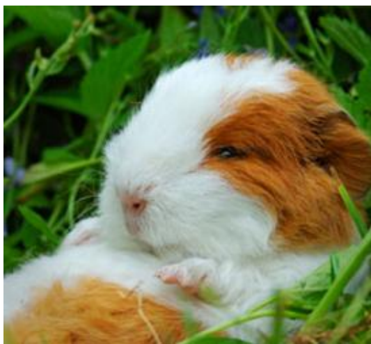
Above: A relaxed guinea resting in the grass