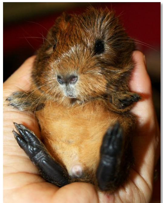
Right: A one-week old guinea pig.

The whole birthing process only takes between fifteen and forty minutes. If you are present when she goes into labor, you will see her 'hiccupping' or experiencing pre-labor pains. With each contraction she will hunch up and then reach under her and grab the baby. The mother bites through the umbilical cord and cleans the embryonic sac off of the baby's face. Four or five minutes later, the next baby should come out.